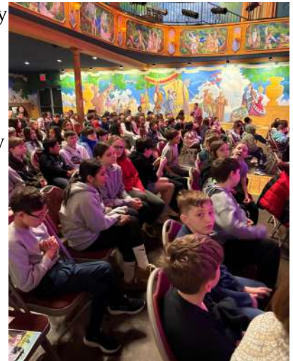
Our March field trip to Growing Stage Theater to see a play about Ben Franklin.

In math, we have finished our math book with a study on volume, surface area, and statistics. Next month, we will be doing some review of the NJSLA, which I am sure the 6th graders are looking forward to (we are learning about irony and sarcasm in 6th grade!), before moving on to financial literacy.