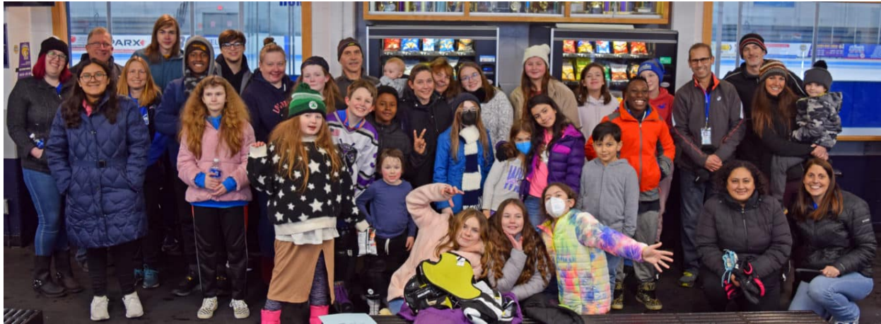
Greater Commonwealth Virtual School families and staff met up at an ice rink in December.