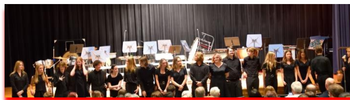
Our Senior lineup

On May 15 th , the CT State Building Trades Training Institute presented to student who were interested in trades. They spoke about their construction readiness training program, their internship program, their apprenticeship training program, as well as the curriculum they follow to provide the most current training to future professionals.