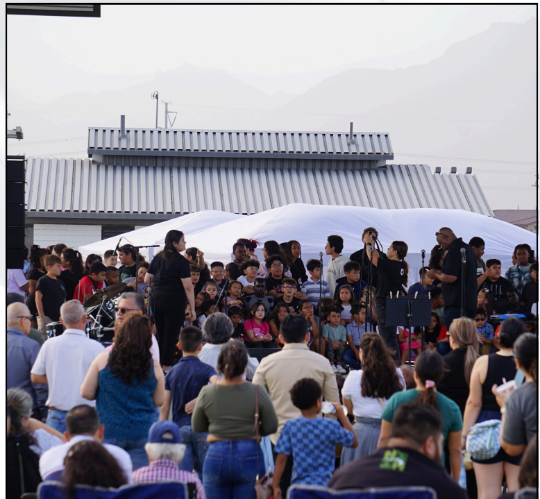
LITTLETON COMMUNITY FESTIVAL

Thank you to our families, partners, and community members for making this year unforgettable!