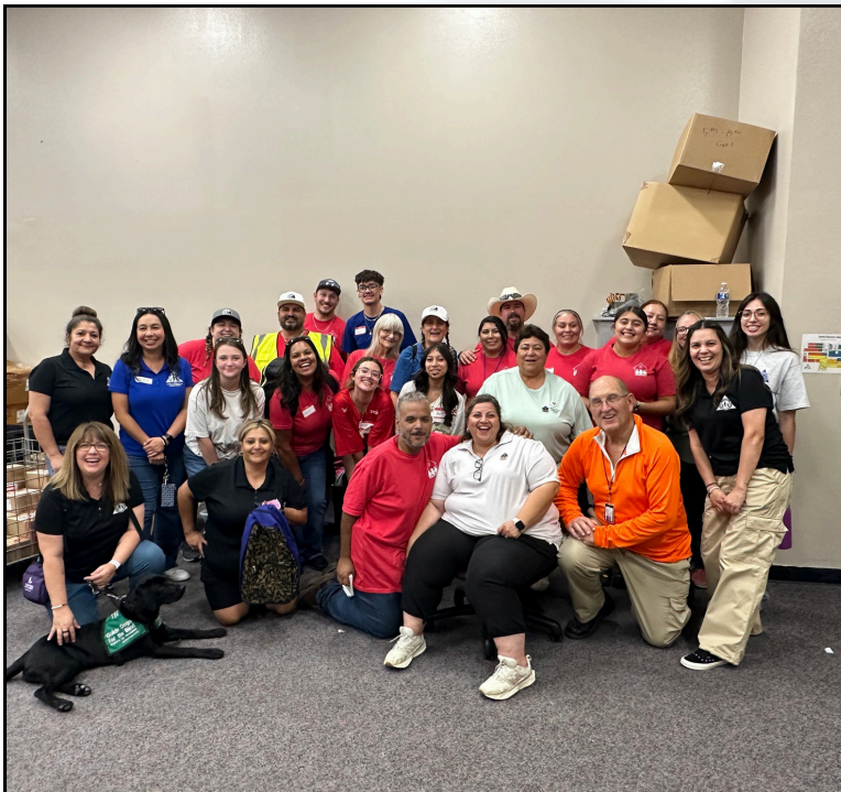
COMMUNITY RESOURCE FAIR